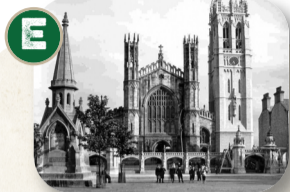
ST. PATRICKS CATHEDRAL

Standing seven storeys high the windmill was a said to have been one of the largest in Ireland. While no precise date has been established for its construction, evidence points to its existence in the early 1790's. An increase in the production of oats and wheat during the Napoleonic wars, was probably the main reason for its construction. Prior to the building of the Windmill the site had been occupied by a brewery. It has not been in use since about 1855.