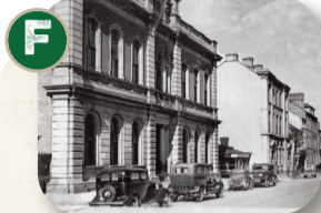
THE TOWN HALL

St. Patrick's Church Roden Place, more commonly referred to as the Cathedral was completed in 1847. It is a late Georgian Perpendicular Gothic Church, modelled on King's College Chapel in Cambridge. It consisting of nine bays of coursed granite with pinnacled buttresses dividing each bay, and a single large perpendicular window filling each gable. The cost was £25,000 and monies were raised through local subscription.