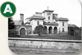
THE OLD GAOL

Built between 1845 and 1853 to relieve problems of the undersized gaol (now Dundalk Town Hall). Designed by John Neville, the total cost of the gaol when completed was £23,000. The Italianate building is situated on a site known as Gallows Hill. The entrance building or Governor's house became home to the Garda Síochána in 1945, while the cell blocks are now occupied by the Louth County Archive.