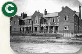
OLD LOUTH HOSPITAL

Began in 1813 and finished in 1818 for the sum of £11,198 and on the site of the 'old courthouse', it was designed by Edward Park, Dublin for the County Louth Grand Jury. The build contract stipulated that the true proportions and rules of Grecian architecture be strictly followed. The design of the portico followed the dimensions of the Temple of Thesus in Athens.