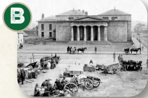
DUNDALK COURT HOUSE

Built between 1845 and 1853 to relieve problems of the undersized gaol (now Dundalk Town Hall). Designed by John Neville, the total cost of the gaol when completed was £23,000. The Italianate building is situated on a site known as Gallows Hill. The entrance building or Governor's house became home to the Garda Síochána in 1945, while the cell blocks are now occupied by the Louth County Archive.