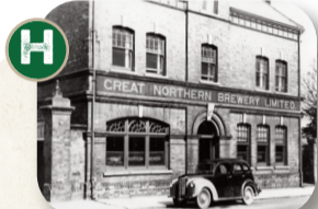
GREAT NORTHERN BREWERY

The Franciscan Friary Seatown or as it is known locally 'Seatown Castle' was founded c1246 by John De Verdun, great-great-grandson of Bertram de Verdun. In 1315 the friary was looted and burned down by Edward Bruce's army, who also killed the guardian and twenty-two friars. The friary had land for the grazing of cattle and the growing of corn, also a corn-mill, orchard and a fish weir on the Castletown river. Only ruins of the belltower remain.