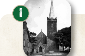
'THE GREEN CHURCH'