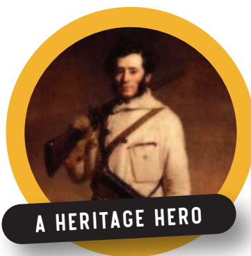
A HERITAGE HERO

Our LOCAL HERITAGE comprises of: Our historical sites, our important buildings, our monuments, our amazing objects in our museum as well as its artefacts and archives. HERITAGE is our man-made structures, our historic buildings and our historic sites, buildings that reflect Dundalk's historical, artistic, architectural, manufacturing and transportational achievements. OUR NATURAL HERITAGE includes our waterways, our local landscapes, our native wildlife such as our insects, plants, trees and birds. OUR NATURAL HERITAGE is our region's biodiversity.