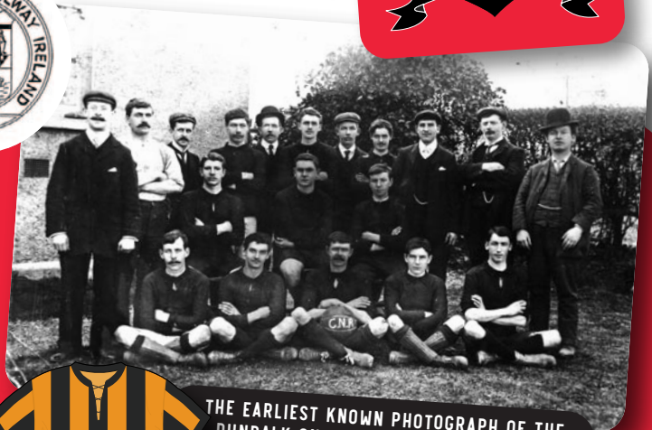
THE EARLIEST KNOWN PHOTOGRAPH OF THE DUNDALK GNR FOOTBALL TEAM CA. 1910.