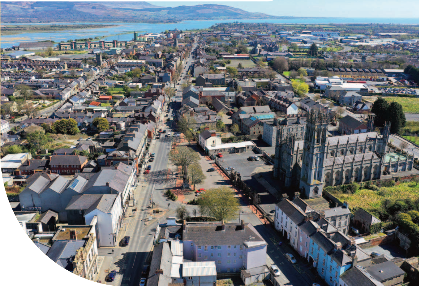
VIEW OF DUNDALK LOOKING DOWN JOCELYN STREET TOWARDS THE BAY