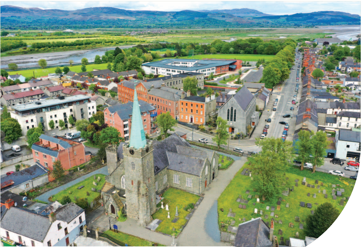
VIEW OF GREEN CHURCH AND MARY STREET TOWARDS DUNDALK BAY VIEW OF SEAN O'MAHONYS GFC, QUAY CELTIC FC AND THE NAVY BANK