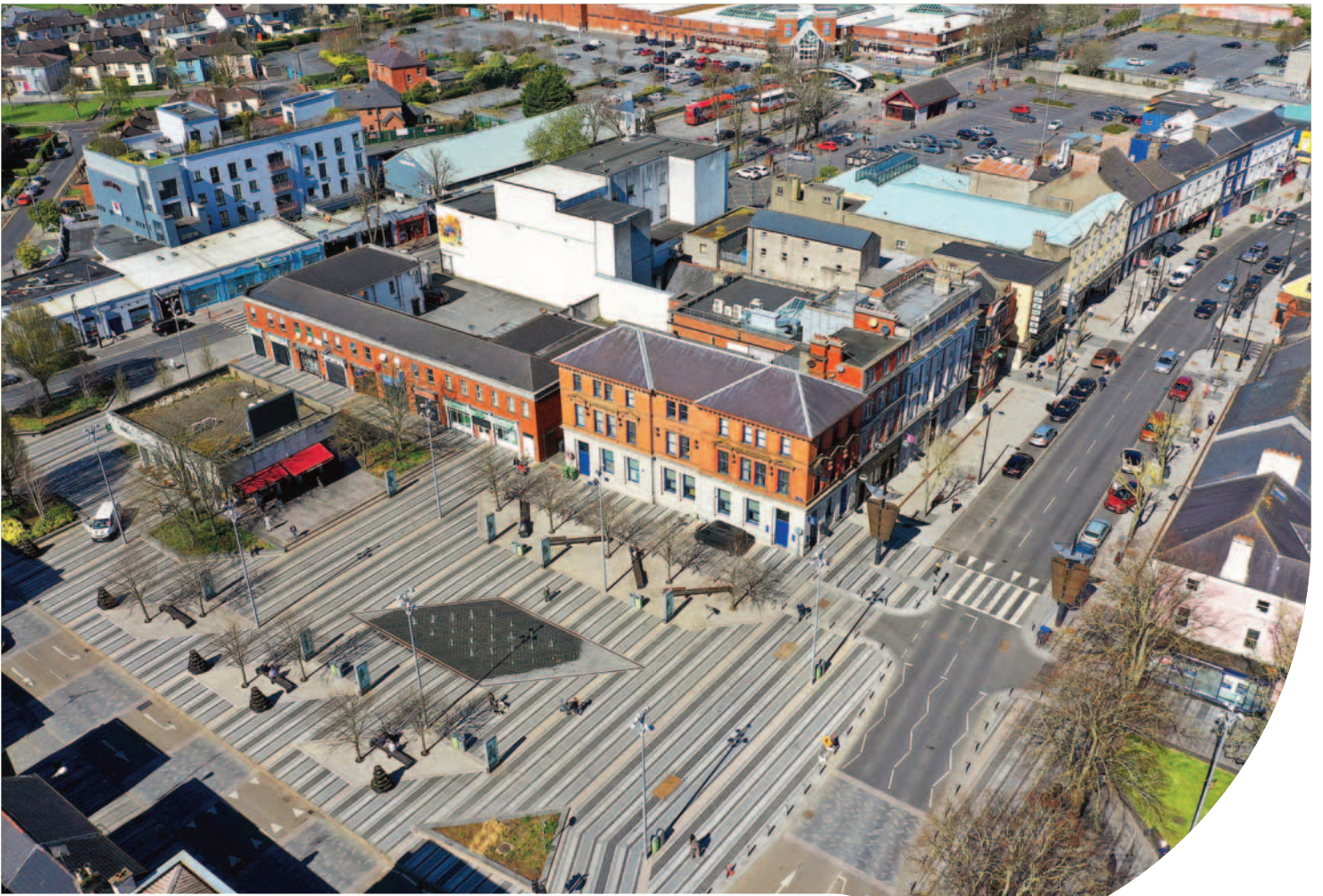
VIEW OF THE SQUARE DUNDALK, THE HEART OF THE TOWN